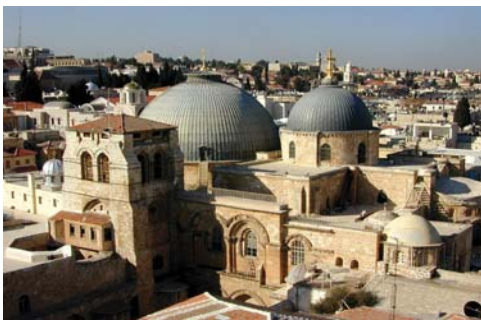
Church of the Holy Sepulchre, Jerusalem