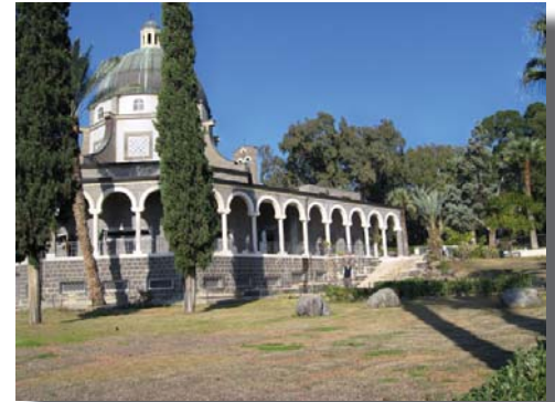
Church of the Beatitudes