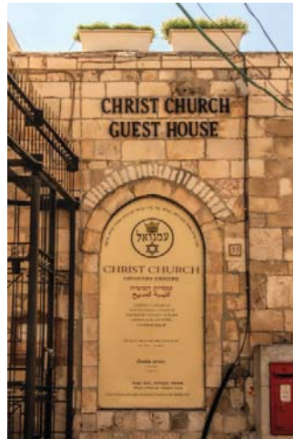
Christ Church Guesthouse