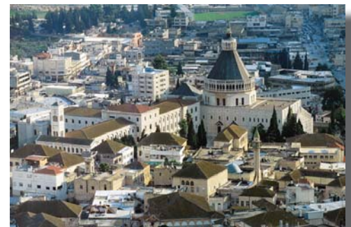
Nazareth Old City