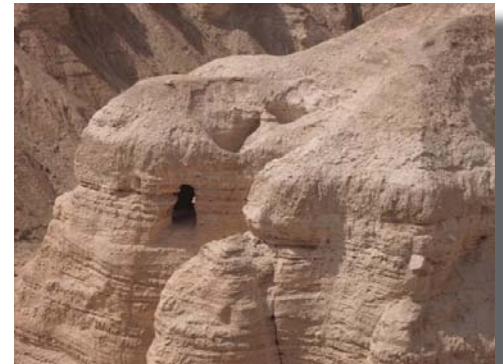
Cave #4, Qumran