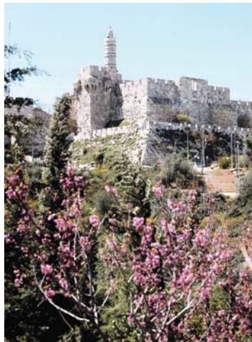
King David's Citadel